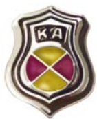
Badge of Member Awaiting Initiation